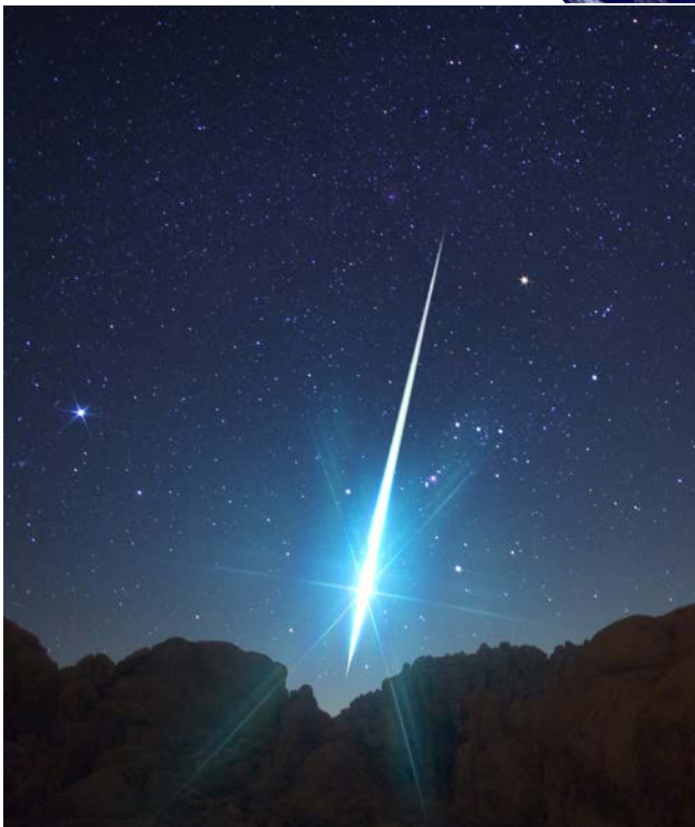
This fireball, seen over California's Mojave Desert in 2009, was caused by a meteor that was once part of a comet.